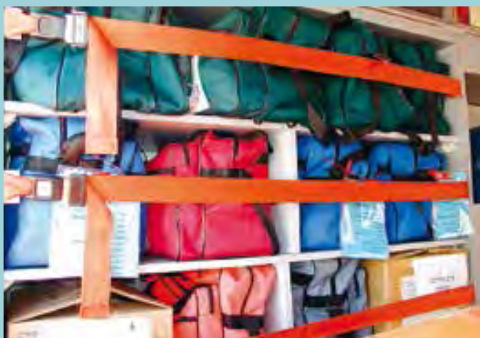
Equipment bags for emergency medical technicians and paramedics