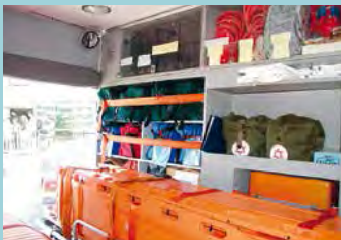
Equipment and supplies carried by the vehicle