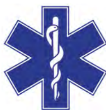
The Star of Life, known throughout the world as a symbol of emergency medical services