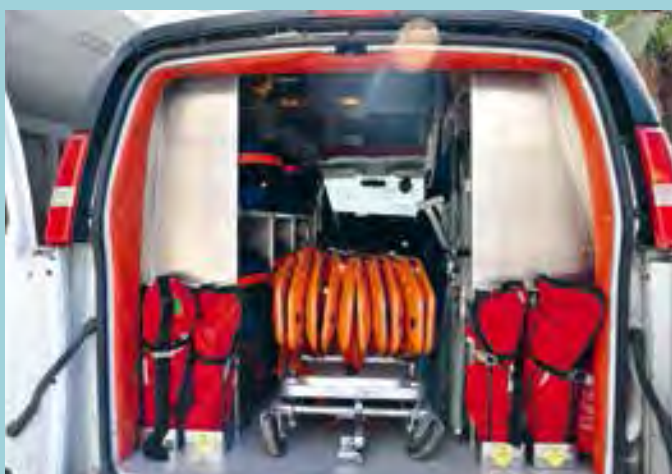
Spinal boards for moving people with suspected spinal injuries