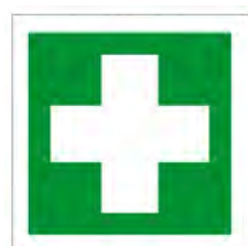
A widely used symbol for first aid

The Misión Médica symbol in Colombia, the sign for all health-care services in the country – created from Resolution 4481, which adopted the Manual de Misión Médica , or the Medical Services Manual . In Colombia, health-care personnel and facilities are collectively known as the misión médica or the ‘medical mission’. The manual is aimed at adopting and implementing a system to strengthen respect and protection for the medical mission in Colombia during armed conflict and in other situations of violence.